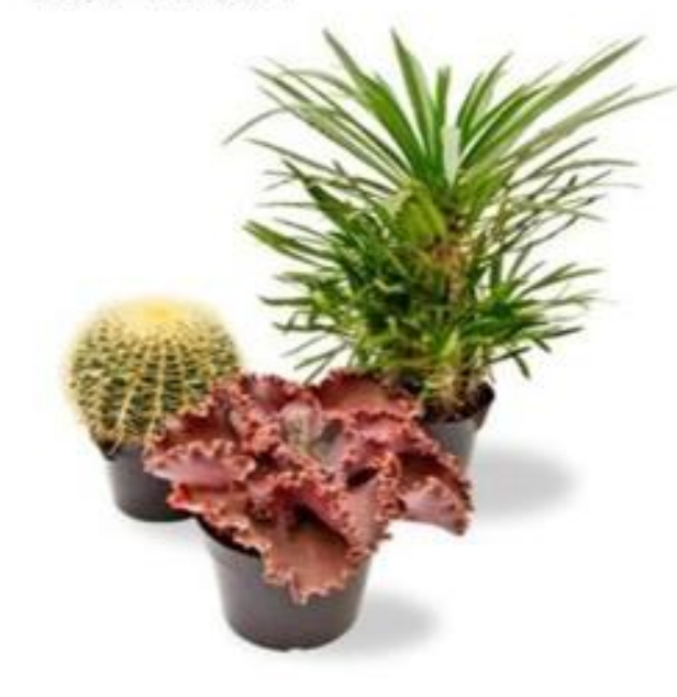
8" Cacti & Succulent Asst. SKU 164615