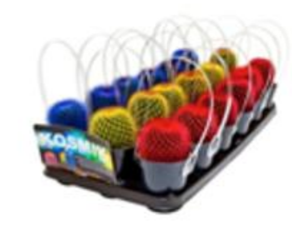
9CM Kosmik Kaktus Asst. SKU 244296