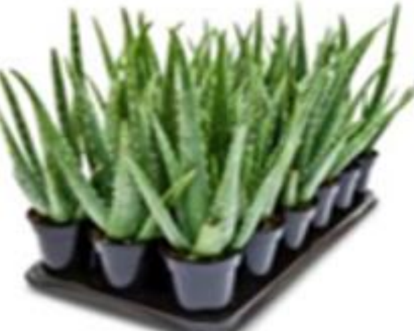
9CM Aloe Vera SKU 922773