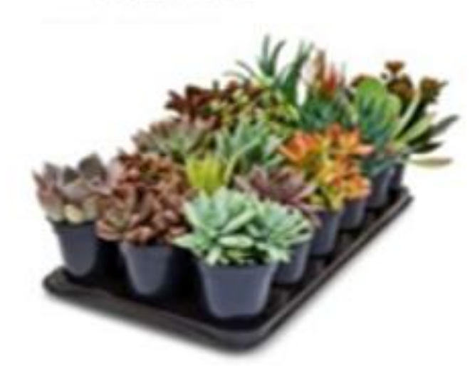
9CM Succulent Asst. SKU 711810