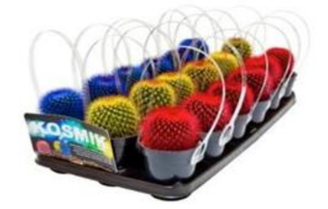
9CM Kosmik Kaktus Asst. SKU 244296