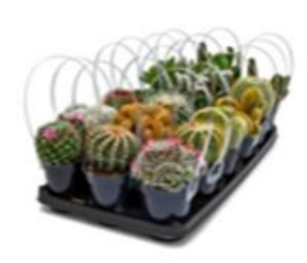
9CM Cacti & Succulent Asst. SKU 711810