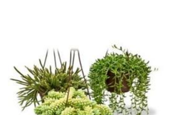
6" Cactus & Succulent HB SKU 211529