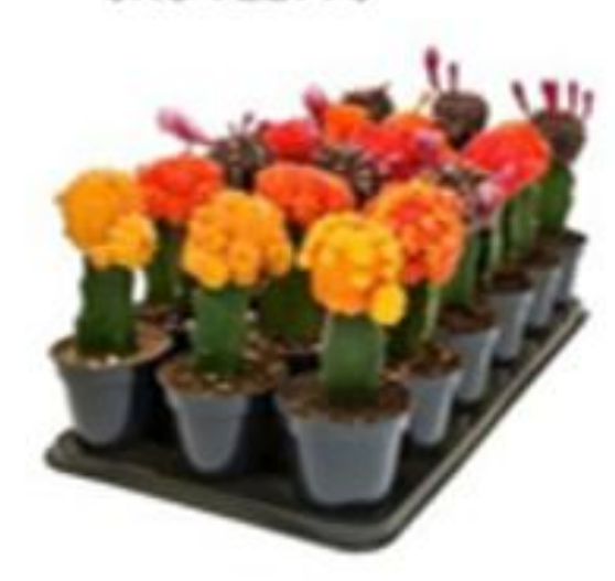
9CM Grafted Cactus Asst. SKU 299935