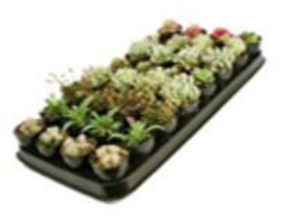
2.5" Mimicry Asst. SKU 487712