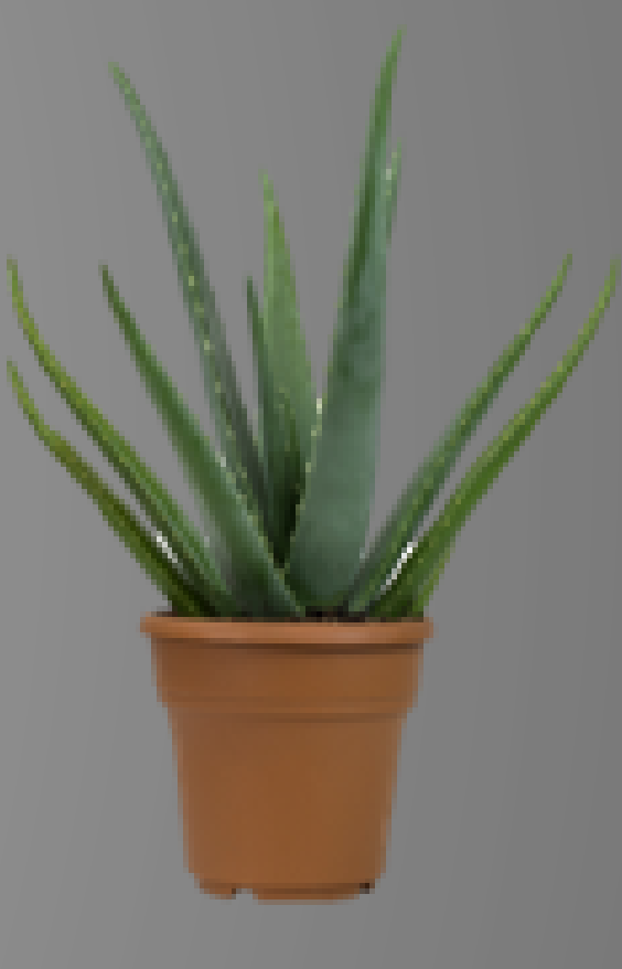
6" ALOE CACHE SKU 271825 Retail $12.98