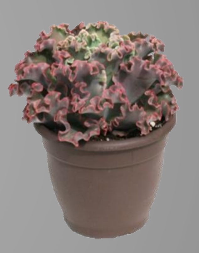
8" BELLA SKU 769503 Retail $19.98