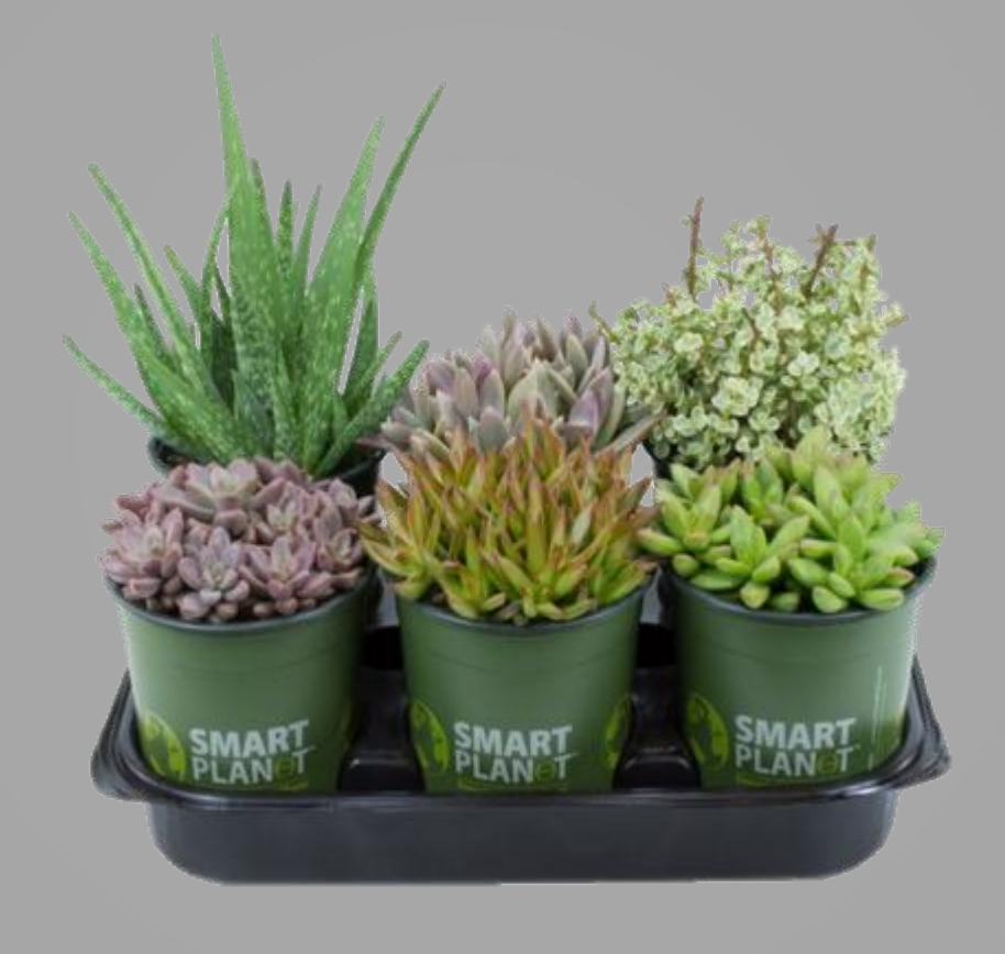
SP 1 GALLON SUCCULENT SKU 312940 Retail $12.98