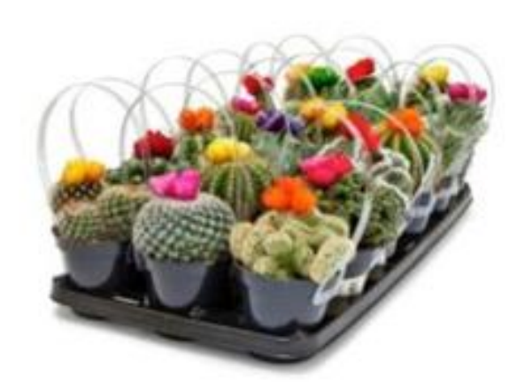
9CM Cactus Strawflower SKU 420571