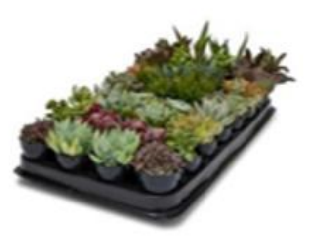
2.5" Cacti & Succulent Asst. SKU 164453